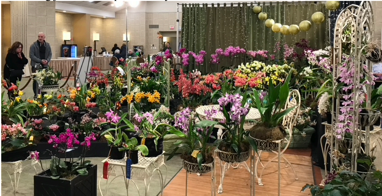
The CAIOS display – well, most of it, it was too large for my cell phone camera to capture